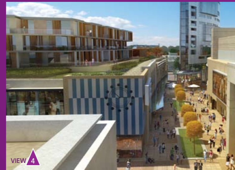
VIEW 4 ▲ View north to Velizy Place from Crown Walk