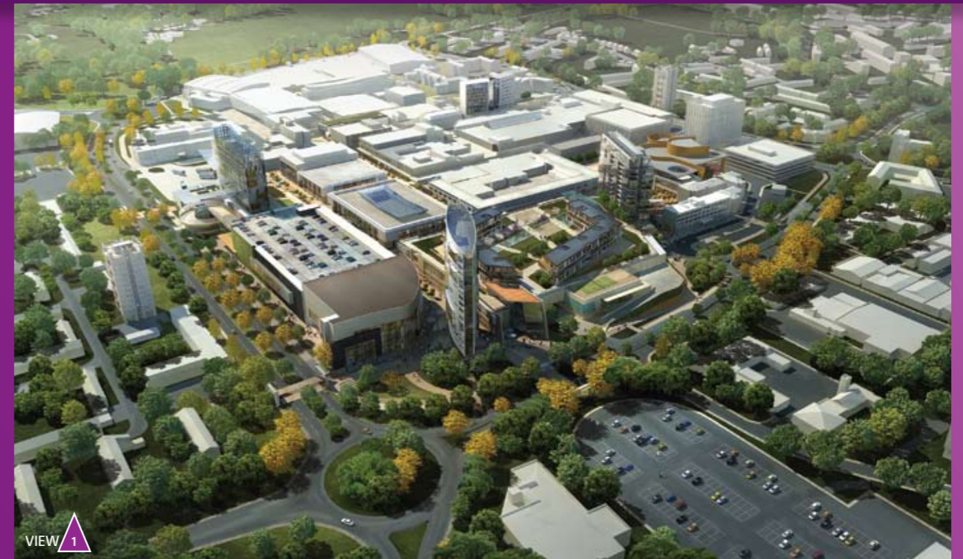
▲ Aerial view looking south from above Fifth Avenue

Welcome to the first newsletter on the evolving plans for Harlow Town Centre North, the major regeneration project for Harlow's town centre.