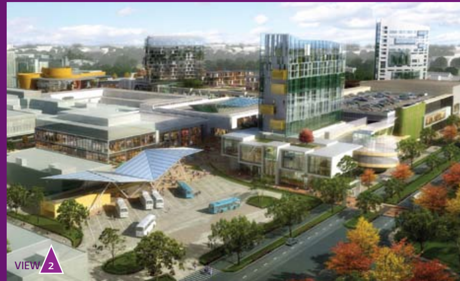
VIEW 2 ▲ View of the new interchange from above Velizy Avenue

The regeneration will improve access to Harlow's town centre. Travelling into and out of the town centre will be enhanced through better public transport provision, including a new bus interchange. The new interchange will significantly improve the operation of the bus station, and will include waiting rooms, kiosks, bus departure gates and real-time traffic information.