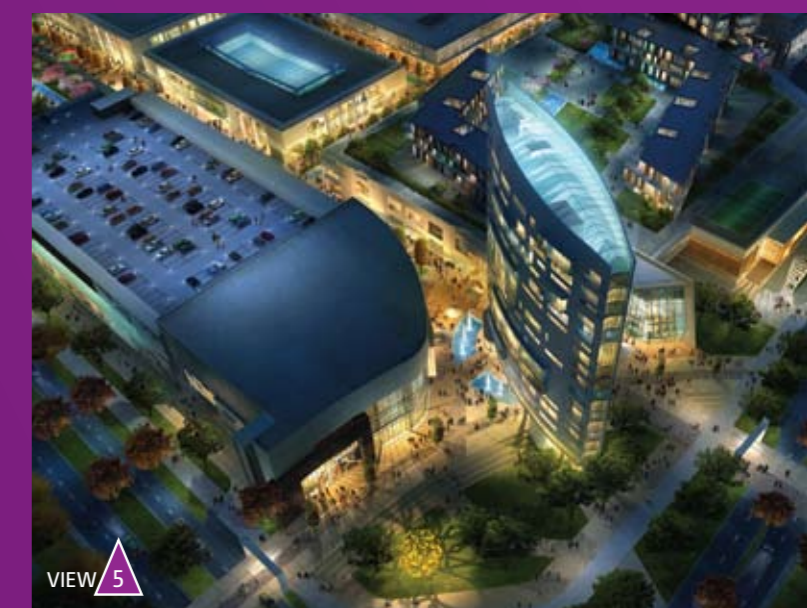
VIEW 5 ▲ Velizy Place at night