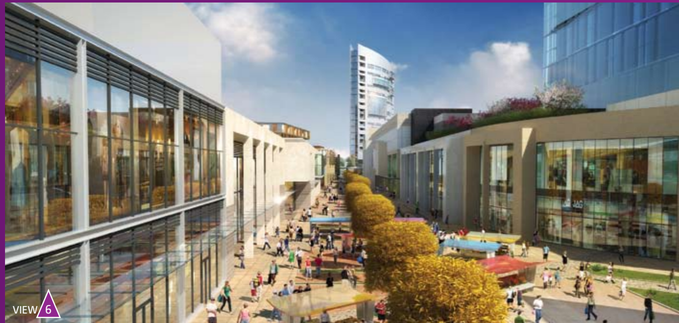
▲ View along Crown Walk from the new market