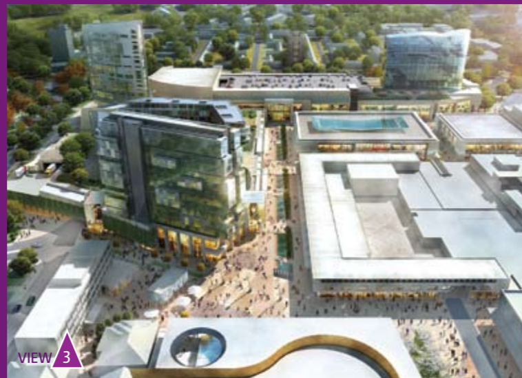
VIEW 3 ▲ View east along Grand Walk towards the new department store

Major new retailers will be attracted to the town centre through the provision of state-of-the-art shops and improved public spaces. These retailers cannot physically be accommodated in the town centre at present, and the new retail offer will include a major department store and new food store for Harlow. The plans will also include a new, attractive market for current and new traders.